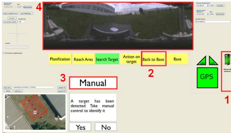
Figure 1: Interface used for supervising the robot.

The participants used an interface to remotely control the UGV without any direct visual contact (see figure 1). At the beginning of the mission, the UGV autonomously navigated in supervised mode to reach the search area (segment 1). Upon arrival, it started autonomous scanning for detecting the target (segment 2). When the robot was in the vicinity of the target, a message was sent to the human operator to take over and control the rover in manual mode for a discrimination task associated with the target (segment 3). While the human operator was involved in the discrimination task, a “low battery event” was sent by a wizard of Oz (start segment 4). In turn, this event triggered a safety procedure that made the robot return to base in supervised mode. As this event happened at a critical moment of the mission, it was expected that the human operator would not notice the alerts dedicated to warn him of the low battery event.