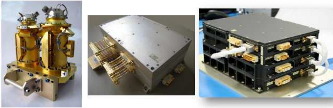
Figure 3. MICROSCOPE's Flight Model instrument. From left to right: Sensor Units, FEEU, ICU.

As of August 2014, the T-SAGE flight model is assembled. Fig. 3 shows its Sensor Units, FEEU and ICU.